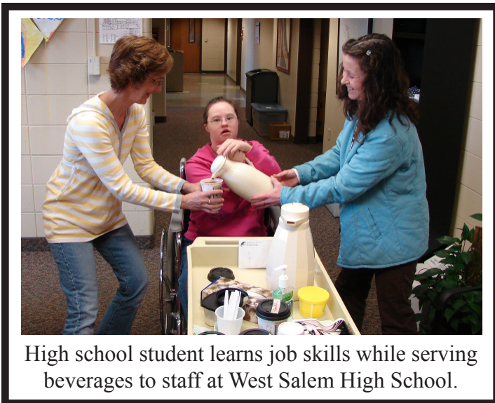
High school student learns job skills while serving beverages to staff at West Salem High School.