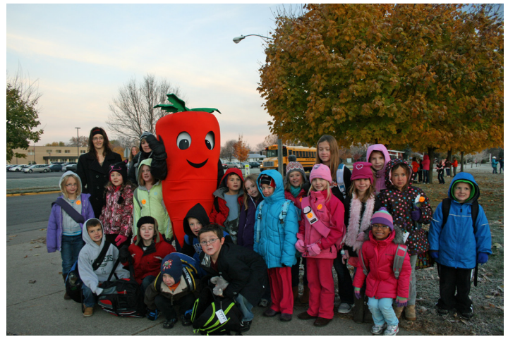
November 4, 2011 Walking School Bus participants.