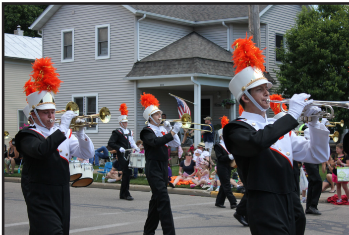
WSHS Band performs in the June Dairy Days Parade