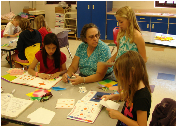
A lot of activities going on during summer school!