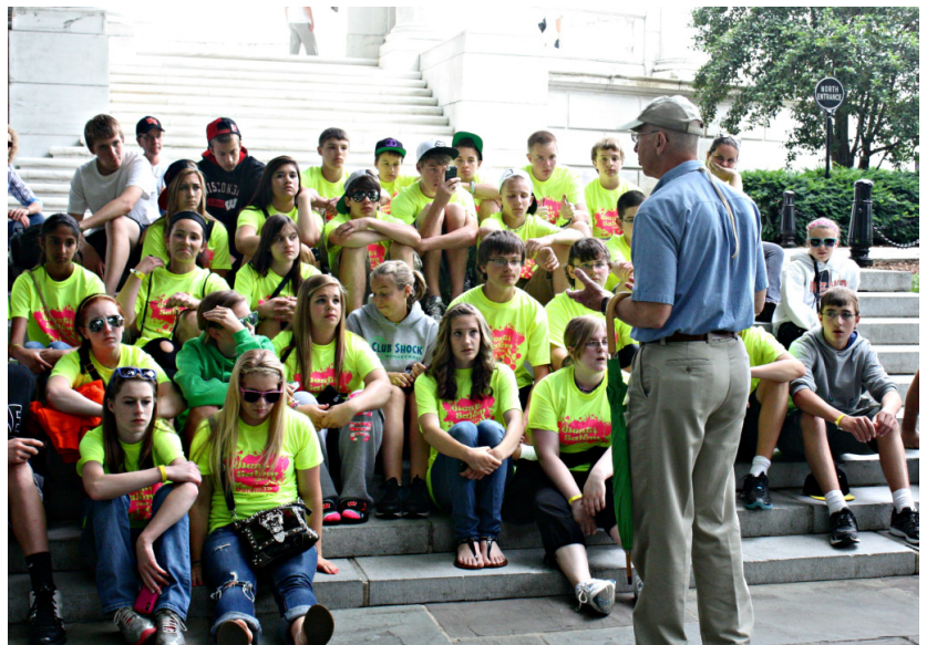
Students learning about Day 1 of Gettysburg at Gettysburg National Park

June 2012 marks the first year that the 8th graders at West Salem Middle School have had the opportunity to travel to Washington D.C. This year's trip took place June 3-8th.