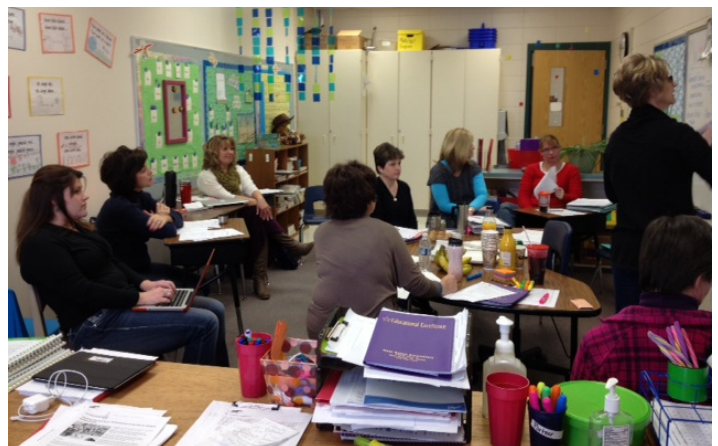
Teacher representatives from each grade level and our Lead Teachers work on aligning K-5 Social Studies curriculum.