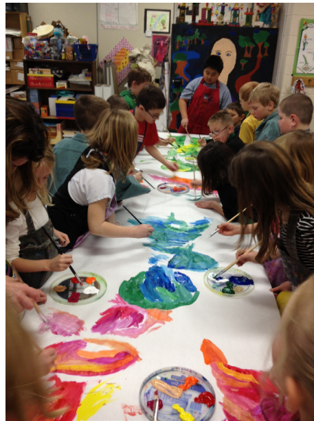
2nd graders working on music program scenery in art class