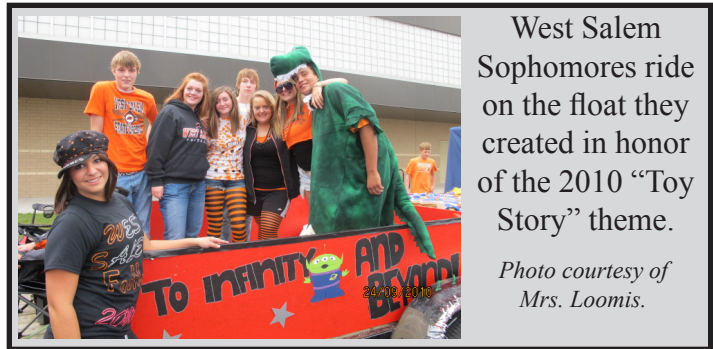
West Salem Sophomores ride on the float they created in honor of the 2010 "Toy Story" theme.

Tax Levy Rate: The tax levy rate is calculated by dividing the levy amount by the total district property value. Using the data for 2010, the calculation is as follows: $6,760,376 (total levy amount) / $696,853,206 (total property values) = .00970 (levy rate) or $9.70 per thousand.