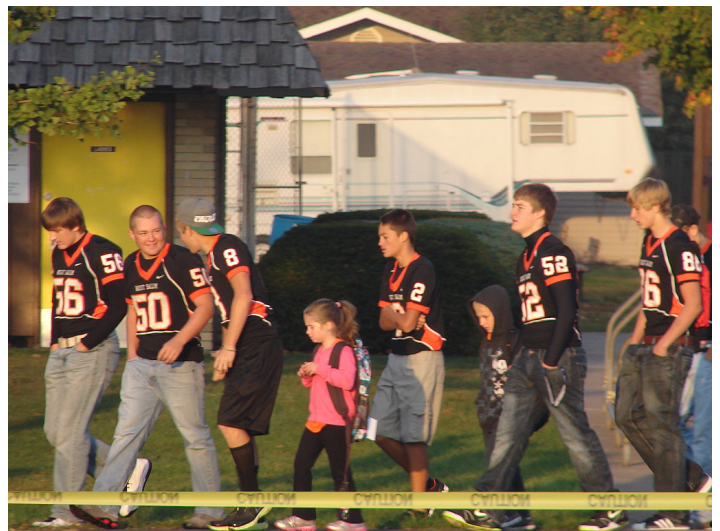
September 28 Walking School Bus - students escorted by members of the WSHS football team.

You may also contact Superintendent Troy Gunderson at the district office by calling 608-786-0700.