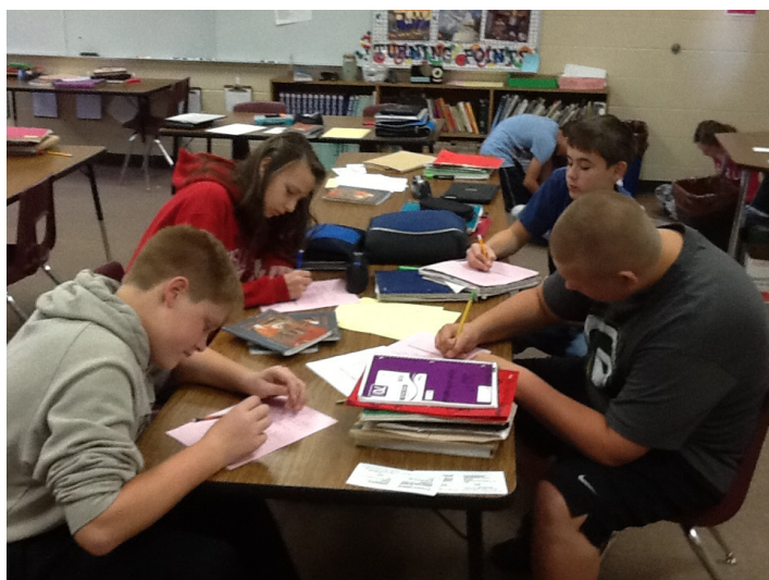
WSMS 8th Graders Collaborating During Language Arts Class

The West Salem Historical Society is sponsoring a photo contest to capture the spirit and essence of the West Salem area. Photos may feature, but are not limited to, landscape( plants, trees, vegetation, flowers), unique or historical structures, all seasons' recreational activities, family fun, rural activities, wildlife natural to this area or a hidden treasure yet to be discovered in our local area. The top 25 photos will be on display at the West Salem Tourism Center for the 2013 season. Ribbons will be awarded to the top three photos. For further details contact Sharon Fuller at 786-0886. Please join us and discover West Salem from your camera's view!