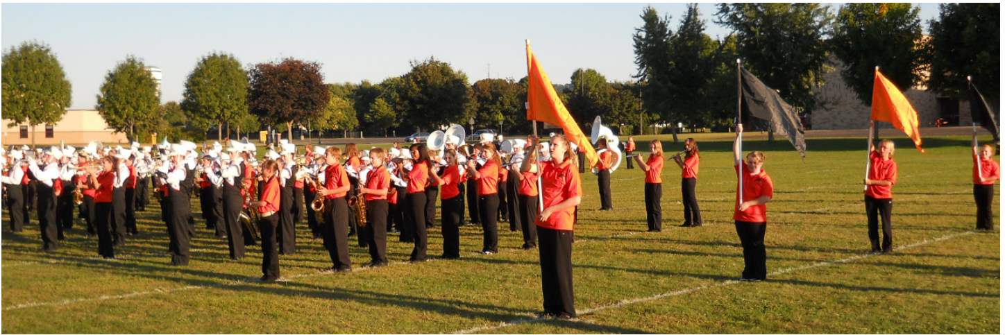
The West Salem High School and Middle School bands perform together during the half time show of the home varsity football game with Arcadia. (See article and pictures on page 11.)