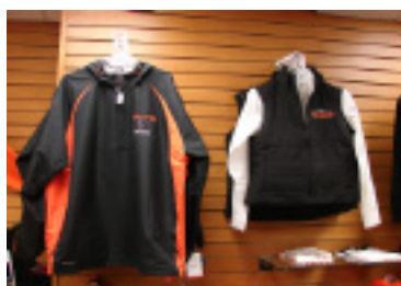
Show your Panther Pride!

Members of the public may request permission to speak on any item on the agenda. Residents requesting to speak on a specific topic of their choice must have item placed on the agenda prior to the publishing of the agenda, approximately four (4) days ahead of the meeting. This requirement is part of the open meeting law that all discussion must be detailed on the published agenda. Please contact the district office at 405 E. Hamlin Street (786-0700) to have your item placed on the agenda under "Public Input."