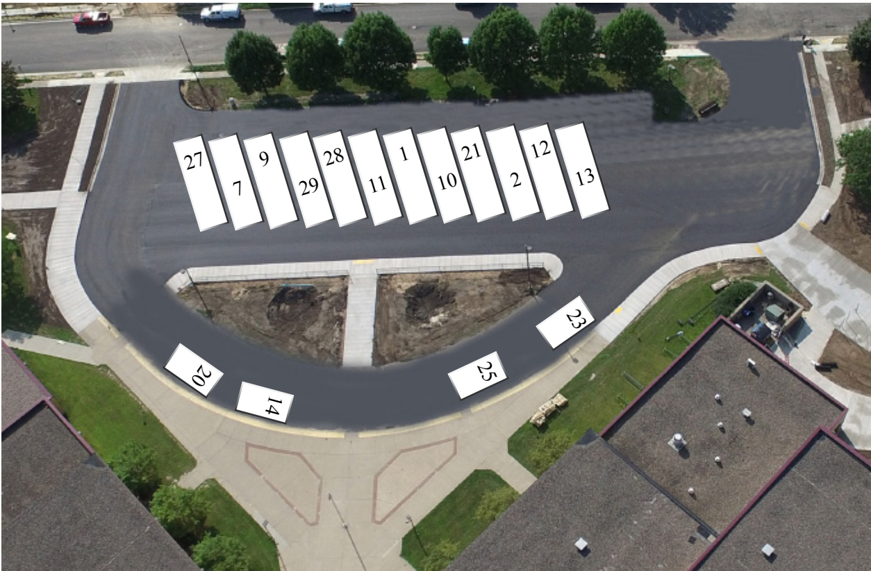
village stops 7-2019.indd