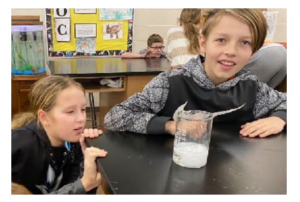
create a chemical reaction called a precipitate! Students had the opportunity to experience this first hand!