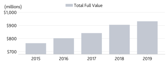
EXHIBIT 3 Full value of the property tax base increased from 2015 to 2019