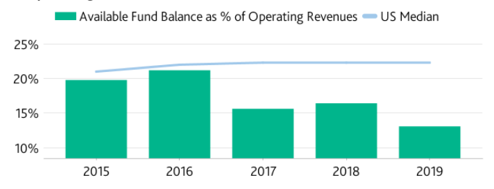
Available fund balance as a percent of operating revenues decreased from 2015 to 2019