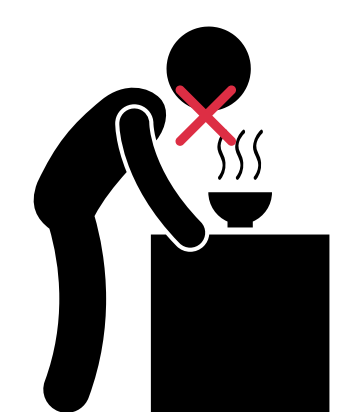
New loss of taste or smell